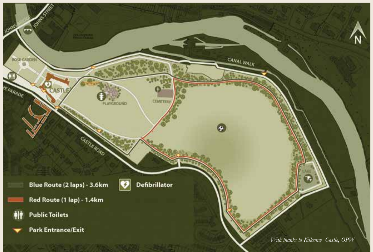
With thanks to Kilkenny Castle, OPW