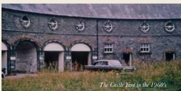
The Castle Yard in the 1960's

In 1963, these buildings were converted to house the famed and formative Kilkenny Design Workshops - a state-sponsored design initiative aimed at improving the design of Irish products and increasing exports. Designers from across Europe were employed as lead designers and mentors, making Kilkenny a centre of design excellence, and contributing significantly to the development of contemporary craft practice in Ireland.